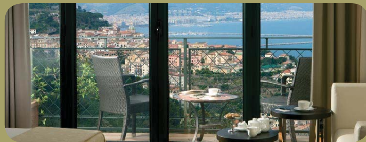
View from Hotel Raito

Arrive in Rome in the morning, meet your guide and transfer via private motor coach to Vietri sul Mare on the Amalfi Coast. Check-in to the prestigious Hotel Raito with its refined furnishings and an enchanting view of the Bay of Salerno. Vietri is a lovely town famous worldwide for its hand-crafted ceramics. The city center and the marina district feature many ceramic shops, along with cafes and restaurants. The main monument is the Church of John the Baptist with its elegant dome.